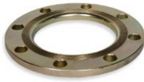
BS Table D